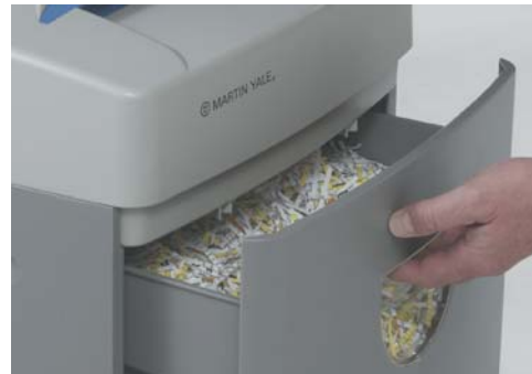
Easy emptying: pull out the entire bin