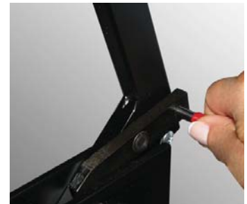
Safety Blade Latch