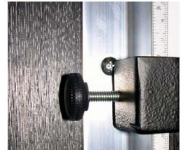
Adjustable Paper Stop